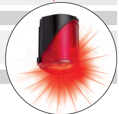
Multi-Tone Sounder in combination with LED Double Flash (Page 211) or LED EVS Signal (Page 212)